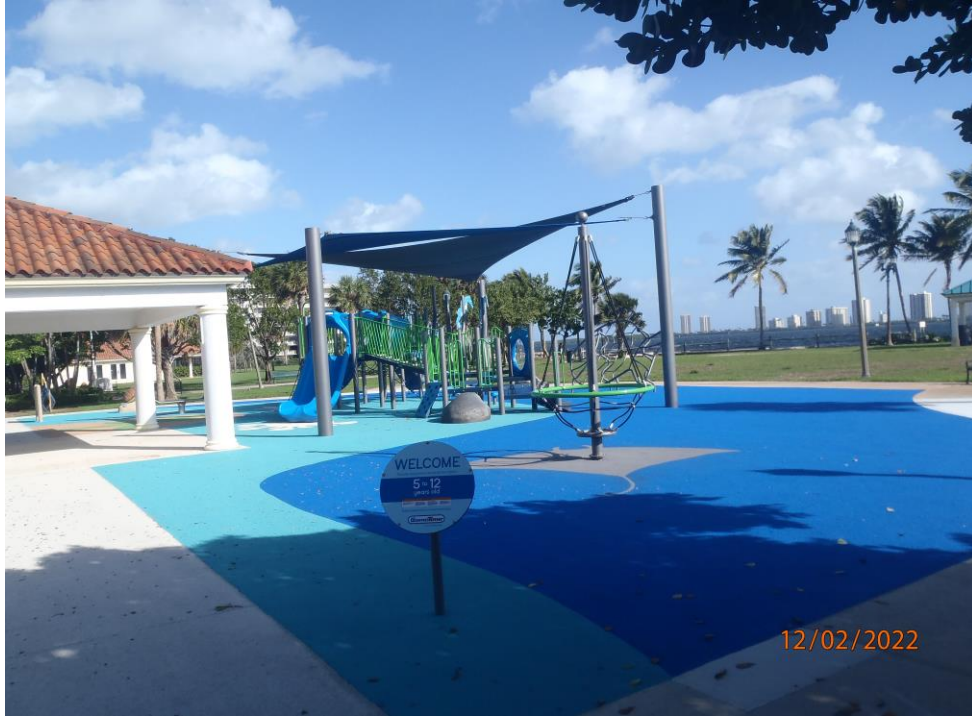
Lake Shore Park (Lake Park)