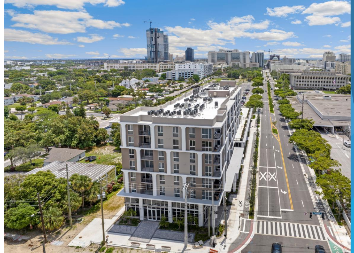
Flagler Station (West Palm Beach)