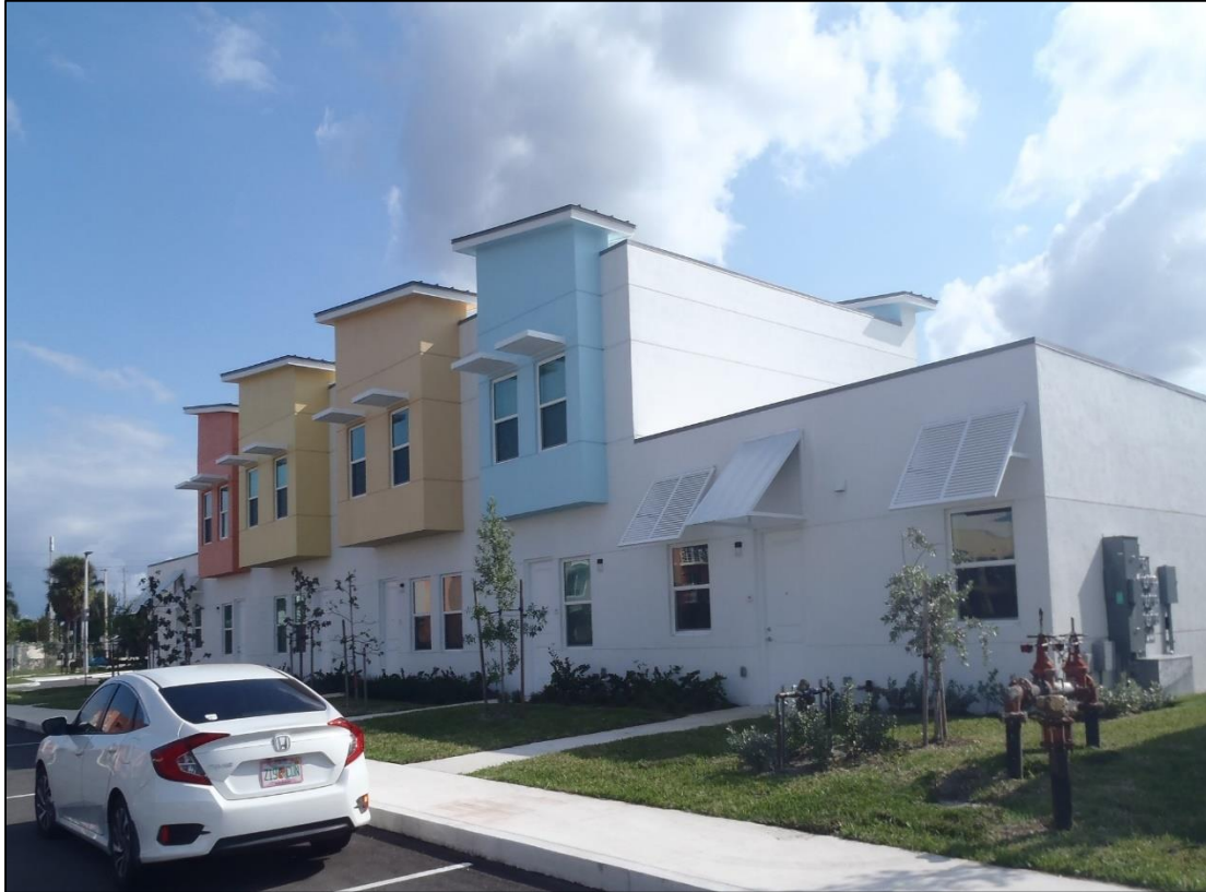
Heron Estates Family (Riviera Beach)