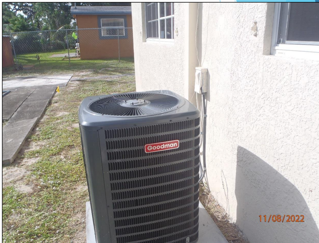
Owner-Occupied Housing Rehabilitation