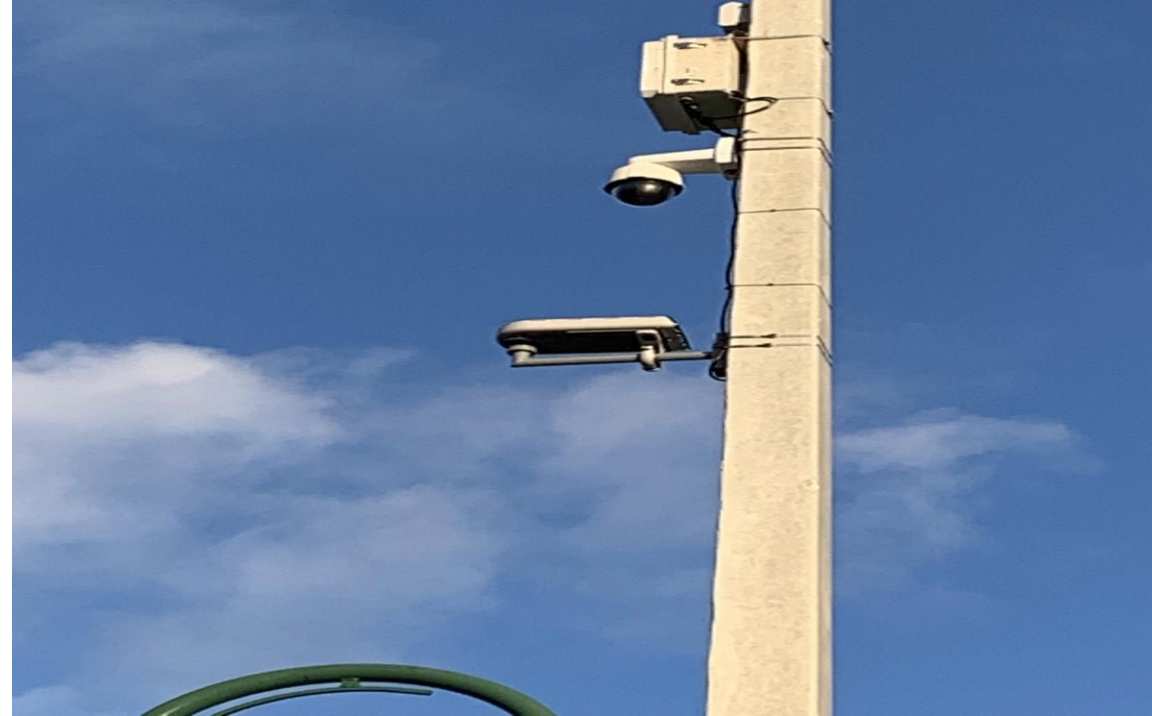
WiFi Routers (Riviera Beach)