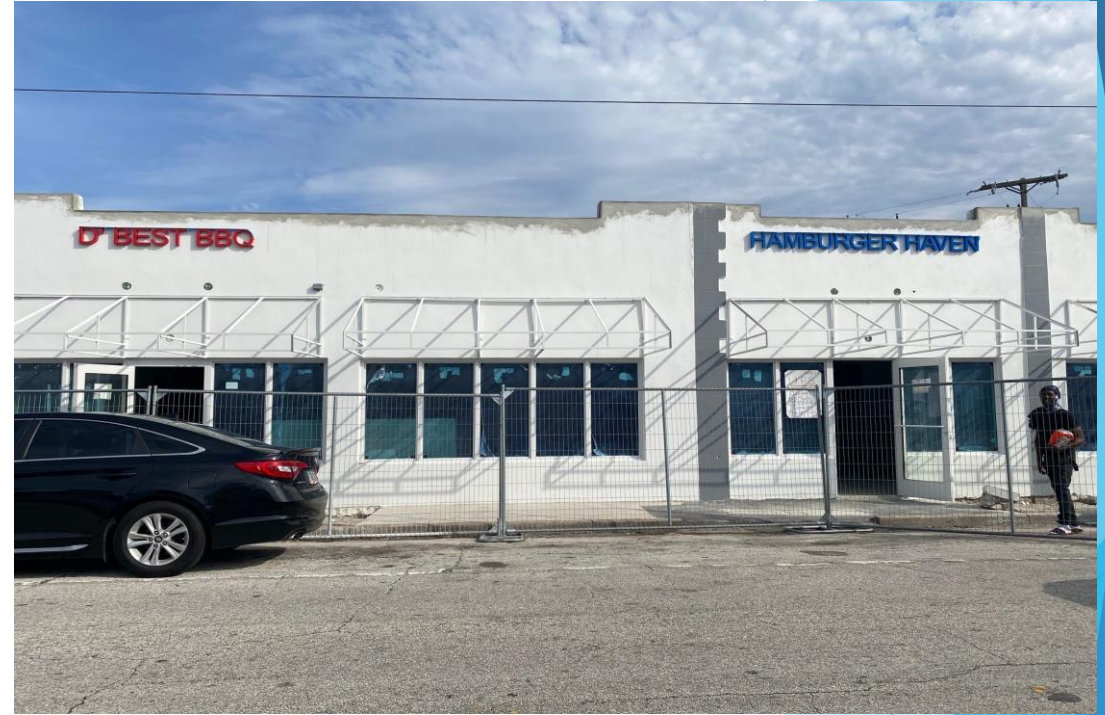
Hamburger Haven - Section 108 Loan (West Palm Beach)