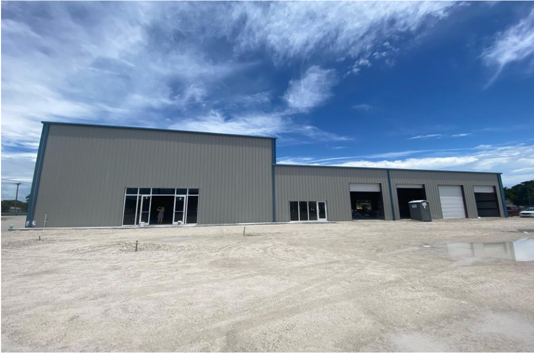
Performance NAPA - USDA and Section 108 (Belle Glade)