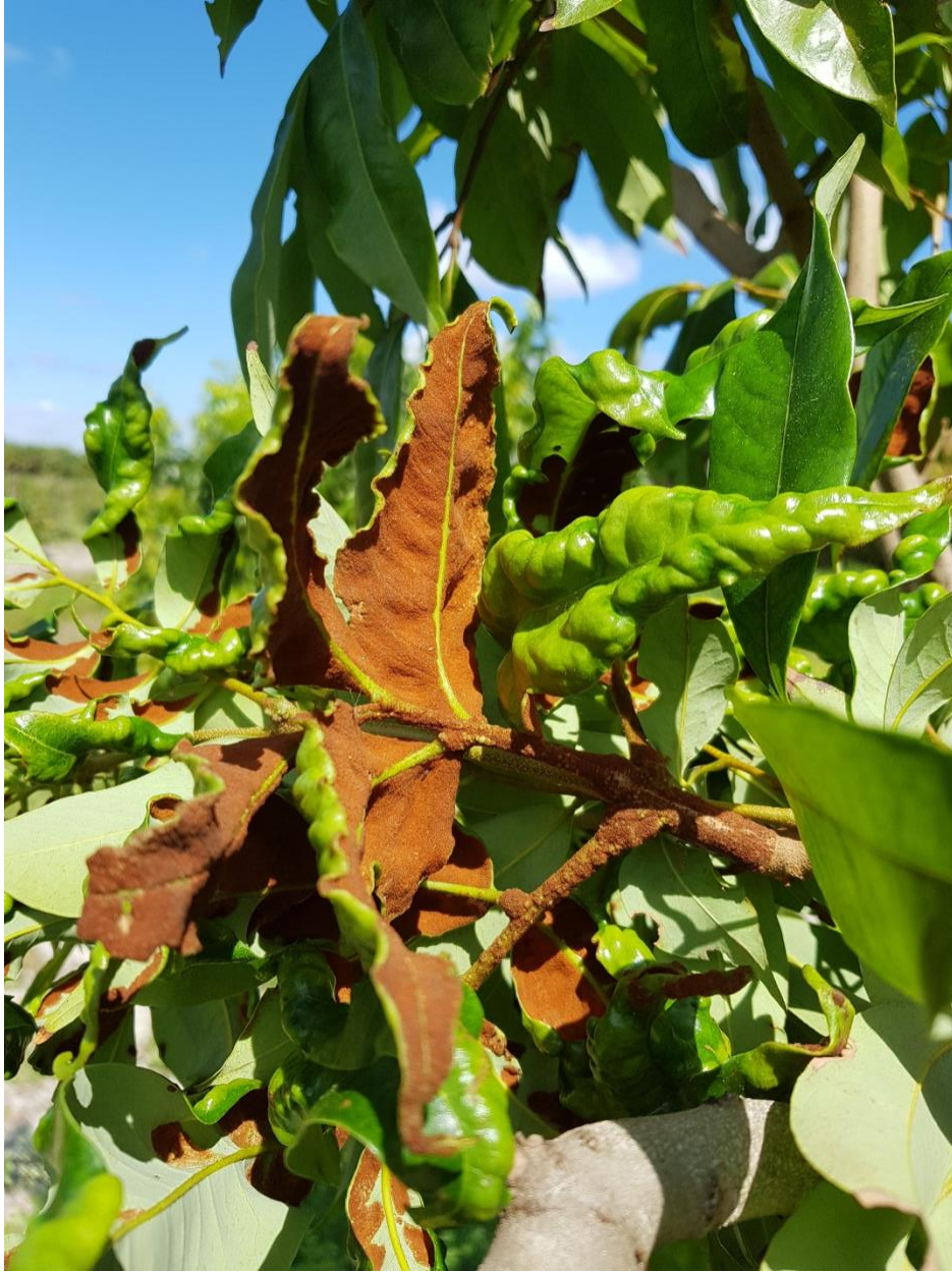
Figure 3. The erineum is a reddish-brown hairy mass that, in some instances, can cover the entire underside of the leaf, which may become distorted or curled.