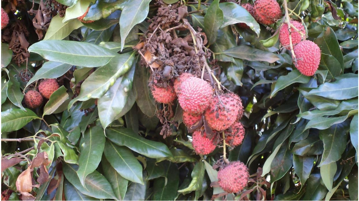
Figure 5. LEM also feeds upon fruit. Consequently, erinea may also develop on fruit.