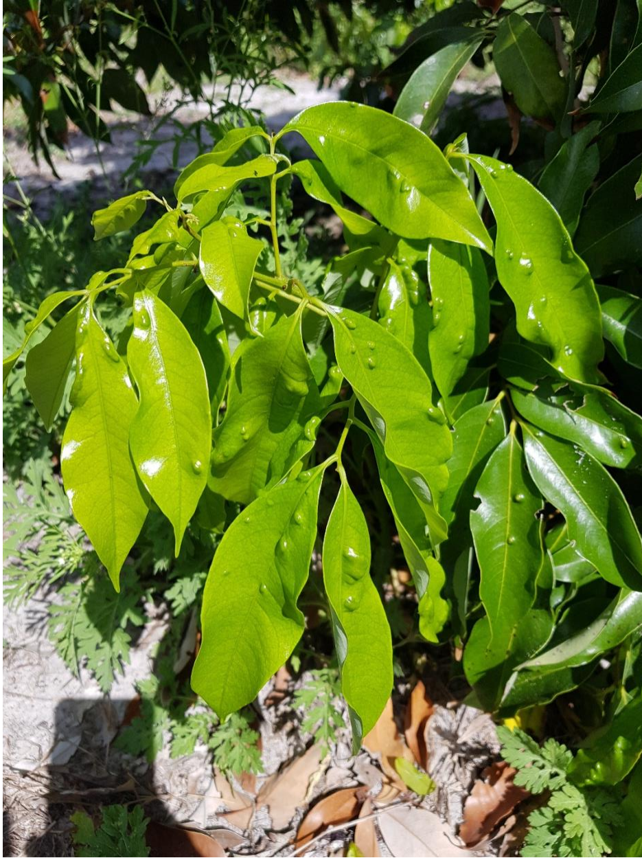
Figure 2. LEM infests immature Lychee leaves and forms small blisters.