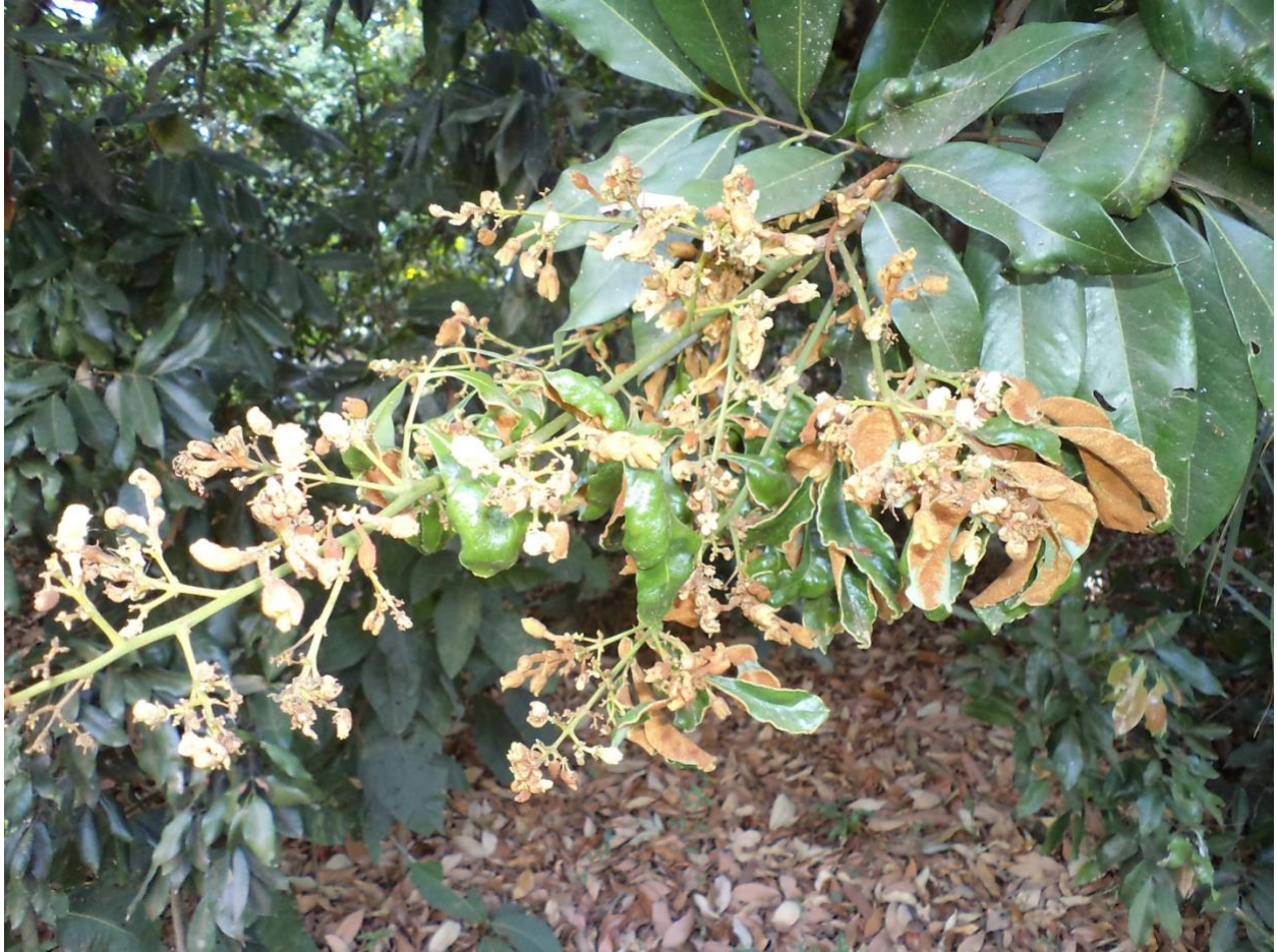
Figure 4. LEM also feeds upon petioles, stems, panicles and flower buds.