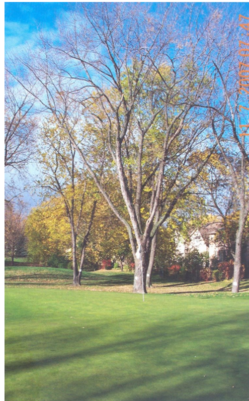
Fig. 4. Premature defoliation of trees (foreground) irrigated with water of electrical conductivity ranging from <1 dS/m during spring and >8 dS/m during summer in Toronto, Canada. Trees in background were not irrigated with reclaimed water.

used for irrigation, it can be assumed that these nutrients may partially supply plant nutritional demand; no research yet is available to support the fact that reclaimed water provides nutrients to plants. When using reclaimed water for irrigation, be sure to test regularly for salt and nutrient levels and to