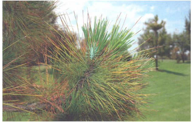
Fig. 3B. Effect of drip irrigation with groundwater containing high total salts, high sodium, and high chloride in southern California. Note that yellow and necrotic pine needles symptoms are typical of root-adsorbed salts. Source: Duncan et al. (2009).

Nutrients. Even after advanced treatment at a wastewater treatment plant, almost all reclaimed water contains detectable amounts of the nutrients, nitrogen and phosphorus. If the reclaimed water is