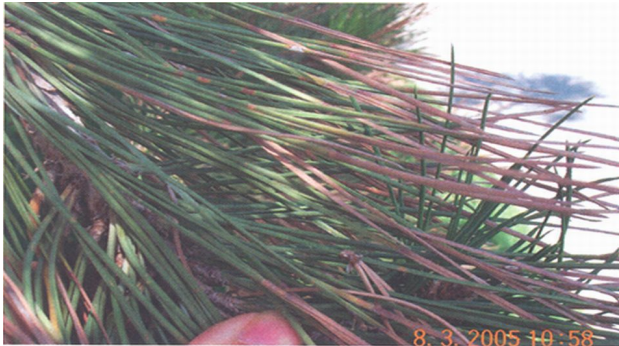
Fig. 3A. Effect of overhead spray irrigation of saline groundwater containing moderate total salts and high sodium in Denver, Colorado. Note that reddish-brown coloration of leaves is typical of foliar-adsorbed salts.

ion then gains preferential status and may accumulate, leading to the problems with sodium described above. You may have excessive levels of bicarbonate and carbonate in your reclaimed water if you see a white chalky precipitate building up on your sprinkler heads.