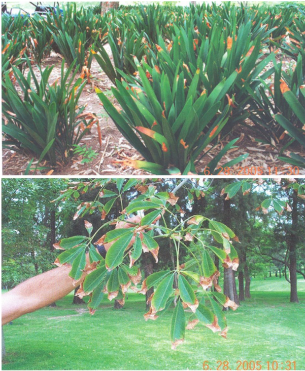
Fig. 2. Chloride leaf-tip burn on ornamental plants caused by reclaimed water irrigation containing moderate levels of total salts (electrical conductivity) and high sodium in Guadalajara, Mexico.