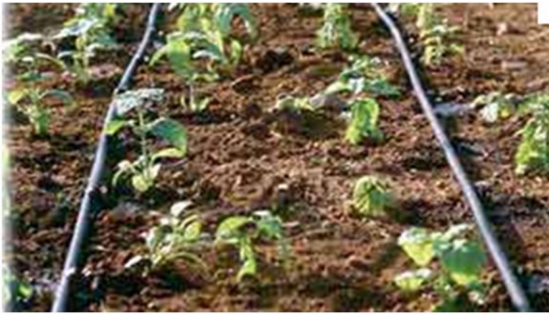
Figure 2. Drip irrigation with reclaimed water.

statement also means that indirect application methods, such as ridge or furrow irrigation, drip irrigation or a subsurface distribution system, which preclude direct contact, are allowed for edible crops that are not peeled, skinned, cooked, or thermally processed before consumption. See Figure 2 for an example of drip irrigation in which irrigation water does not contact plant surfaces.