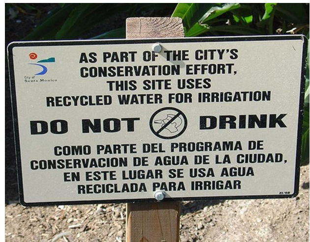
Figure 3. Advisory sign alerting the public to avoid drinking reclaimed water.

Throughout Florida (and the rest of the United States), reclaimed water is transmitted in purple pipes that are kept separate from the pipes that transmit drinking-quality water. Areas that use reclaimed water must also post signs to alert the public of its use (Figure 3). For example, communities that use reclaimed water may post a sign at the neighborhood entrance, and golf courses may post signs at the first and tenth tees. Advisory signs must also include the warning in English and Spanish, "Do Not Drink" and "No Tomar," respectively. Additionally, if reclaimed water is used in a fountain or stored in a pond, it must include an advisory sign that says "Do Not Swim" or "No Nadar" in Spanish.