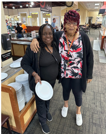
Golden Corral after the South Florida Fair Trip 2025