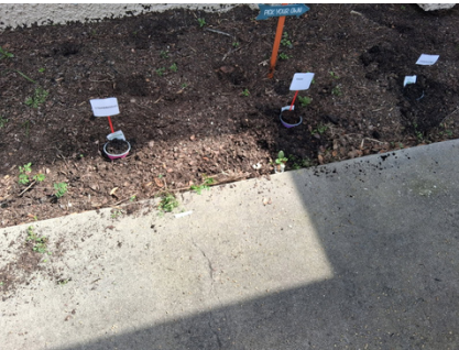
Seniors Garden at West County Senior Center

When: Monday, Thursday, & Friday, 10:00 a.m. - 11:30 a.m.