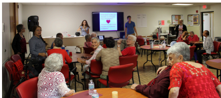
Trivia with Twins at NCSC!

5217 Northlake Blvd. Palm Beach Gardens, FL 33418 (561) 694-5435