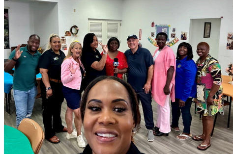
WPTV Senior Prom