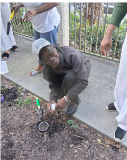
West County Garden "Grow Grow"

When: Mondays & Wednesday, 10:00 a.m. - 11:00 a.m.