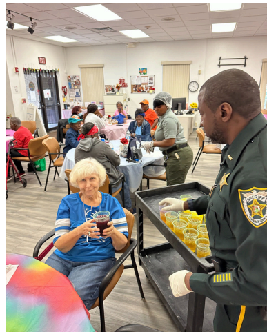
West County Super Bowl Brunch 2025 with PBSO West Detention Center