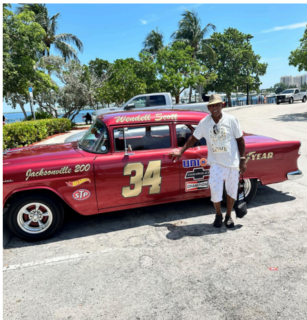
A Day at the Beach West County Seniors Outdoors