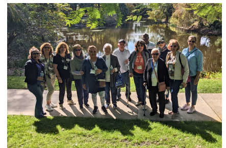
MCSC Gardening Group visiting Mounts Botanical Gardens

When: Fridays, 10:00 a.m. - 12:00 p.m. Description: This is a beginners English class.