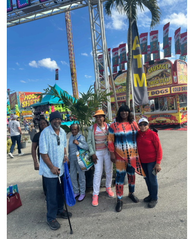
South Florida Fair 2025