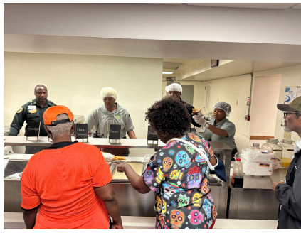
West County Super Bowl Brunch 2025 with PBSO West Detention Center

2916 State Road #15 Belle Glade, FL 33430 (561) 996-4808