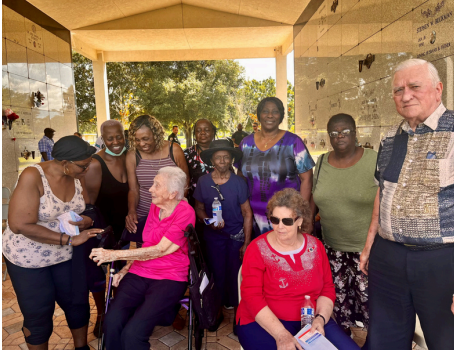
"Storm of 1928"