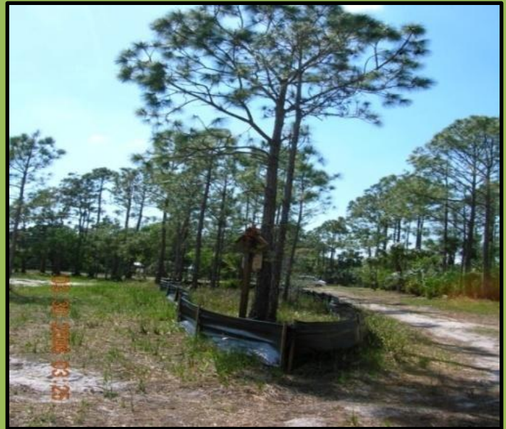
Slash pines barricaded along heavy equipment route

Not enough can be said about the importance of properly barricading your native vegetation.