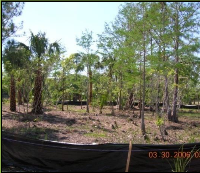
Cypress stand with barricading