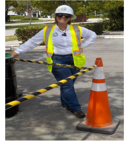
Personal Protective Equipment