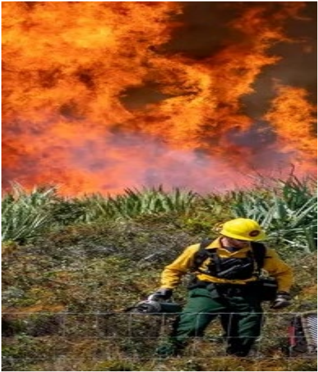
Fire Retardant Gear