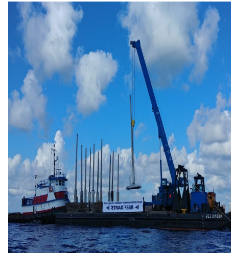
Artificial Reef Deployment Equipment