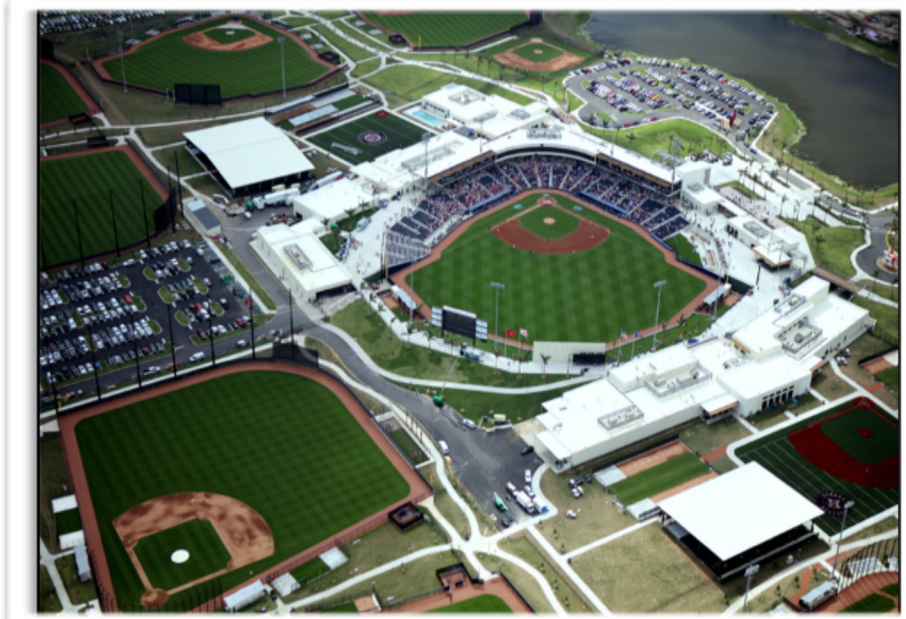
Ballpark of the Palm Beaches