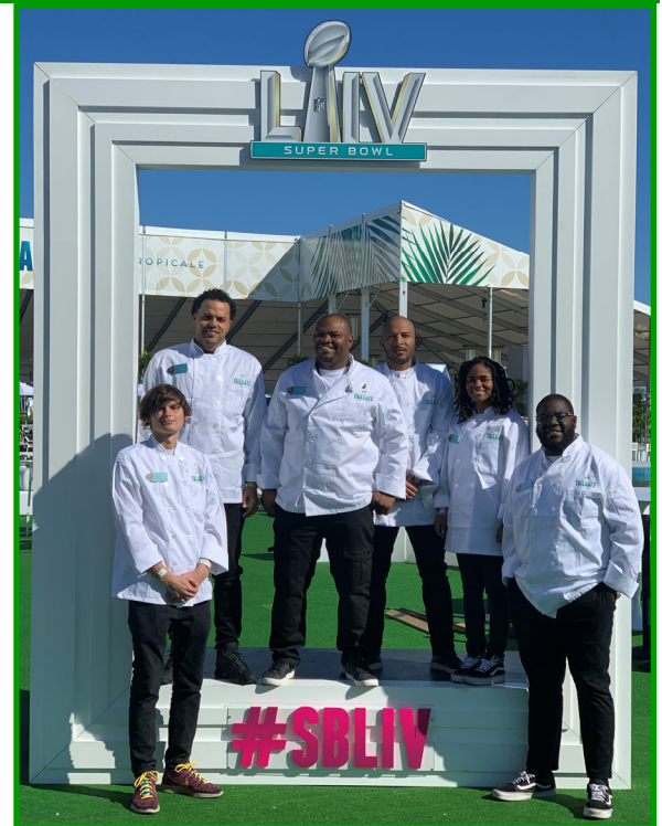
Frostie Flavors Corp.