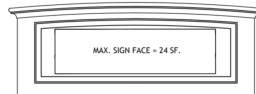
Project Identification Sign - Property corners

NOTE: PER ULDC TABLE 8.G.3.E.-14 IF A DECORATIVE BACKGROUND ELEMENT SUCH AS TILE, STUCCO OR OTHER BUILDING MATERIAL OR COLOR IS USED, THE MAXIMUM SIGN FACE AREA FOR SUCH DECORATIVE TREATMENT MAY BE EXPANDED 24 INCHES, MEASURED FROM THE SIGN FACE AREA IN EACH CARDINAL DIRECTION.