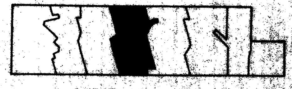
SHEET KEY MAP