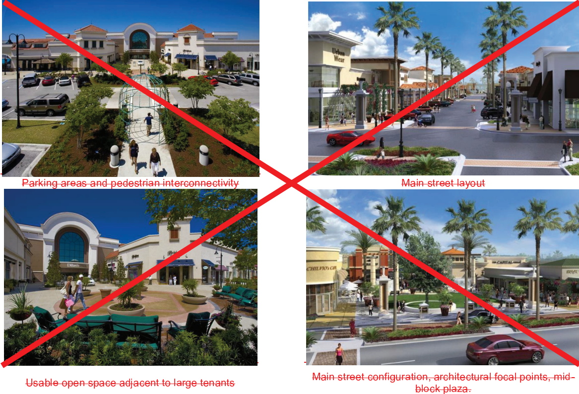
Figure 3.E.8.B—Typical Open Space and Main Street Layouts