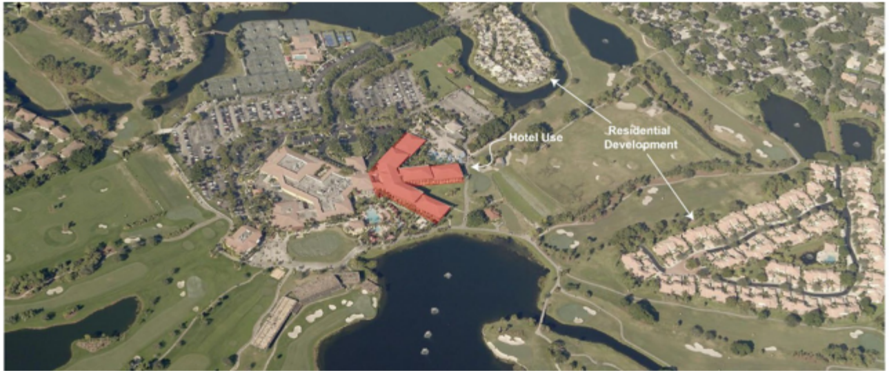
EXHIBIT 1: PGA NATIONAL GOLF CLUB (PALM BEACH GARDENS, FL)

"It allows for a flexible zoning district which is intended to provide an appropriate balance between the intensity of development and the ability to provide adequate capacity within the support service and facilities." Like the proposed amendment, the hotel located at the PGA National retains a Future Land Use designation of Commercial. This is most easily compared to the County's Commercial Pod of a PUD, in which the proposed hotel or motel use amendment is proposed.