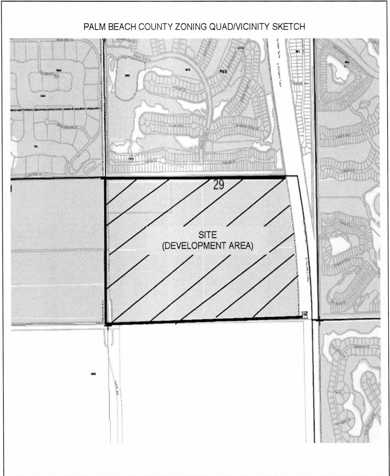
PALM BEACH COUNTY ZONING QUAD/VICINITY SKETCH