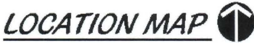
EXHIBIT B VICINITY SKETCH