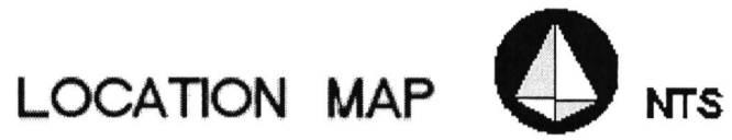
EXHIBIT B VICINITY SKETCH