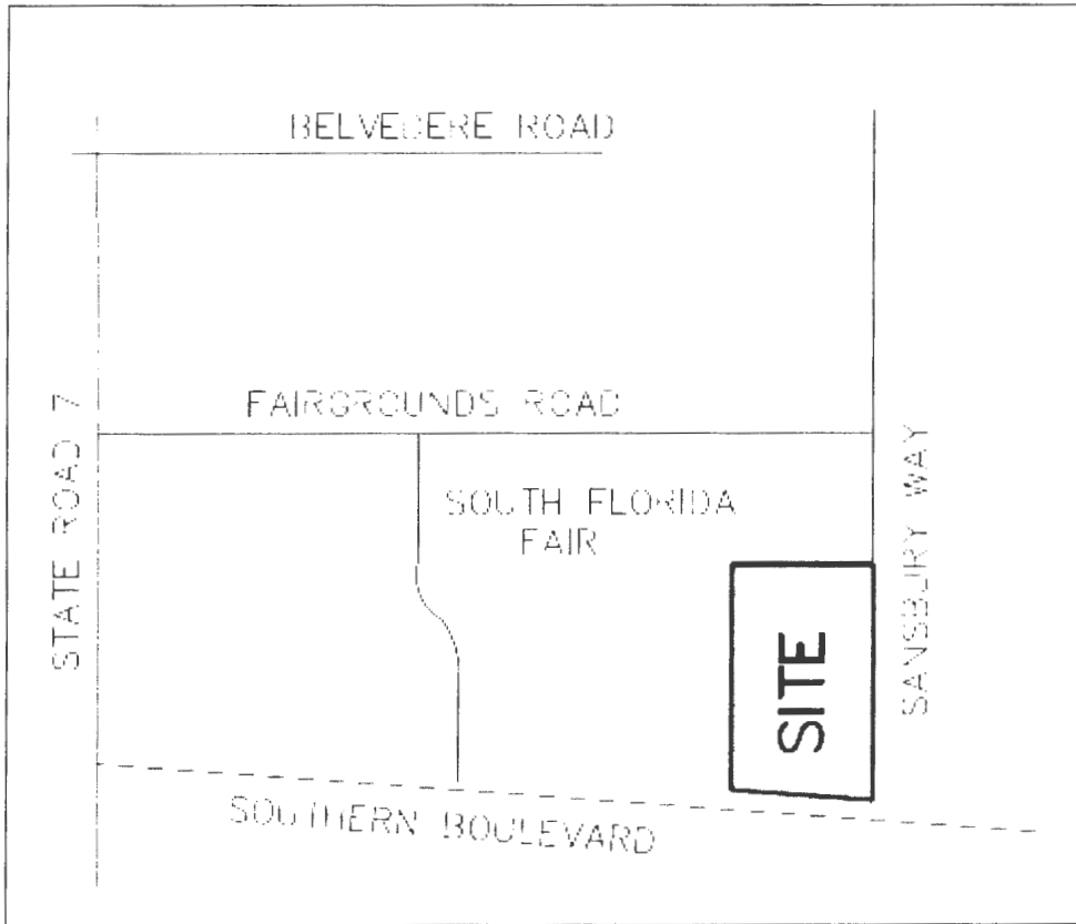
EXHIBIT B VICINITY SKETCH