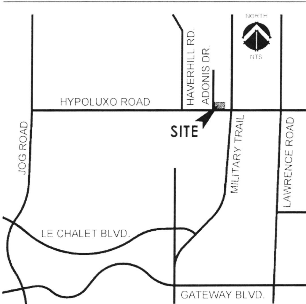
EXHIBIT B VICINITY SKETCH