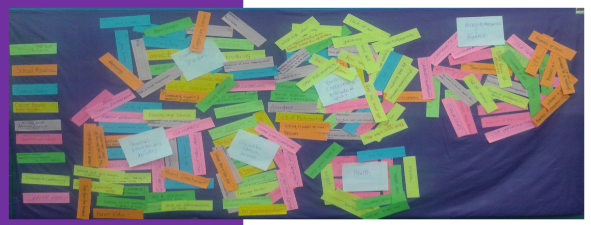
City of Greenacres wall

The purple wall is one of many exercises held during the Community Conversation. It is an analytic method of root cause issues. The vertical multicolor sheets on the left side of the purple wall are the highest rated issues (indicators) voted by the community members. Each sheet on the left represents a group of 5-8 community members. The clusters emerged out of the cause of that issue and based on commonality among the groups during the conversation. The white sheets over the clusters have an assigned title to identify each clusters.