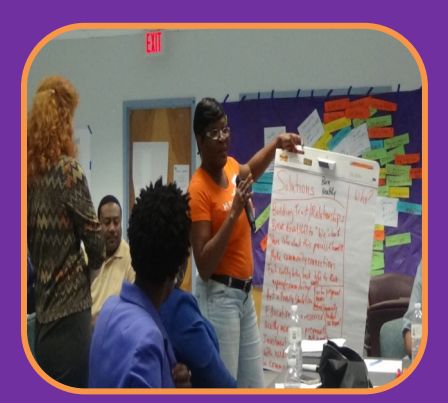
A Riviera Beach Community Member sharing her solution with other community members in the room