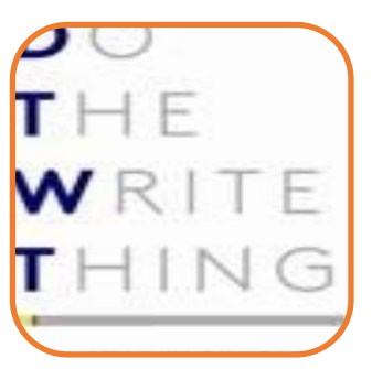
Youth Services staff read and evaluated 325 essays for <u>Do</u> <u>The Write Thing challenge</u>.