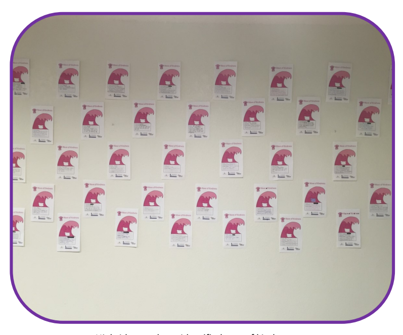
Highridge students identified acts of kindness.

Pink Shirt Day is about making a difference. The semi-annual event encourages participants to sign and wear a pink pledge shirt to show they are willing to take a visible, public stance against bullying and help promote ways to effectively cope with bullies. On February 24, Youth Services Department employees joined the Literacy Coalition of Palm Beach County and its team of nonprofit partners for a countywide celebration of this international event.