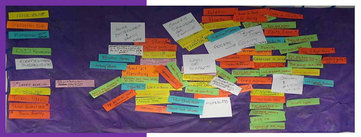
City of Riviera Beach wall