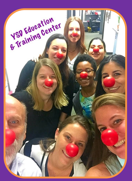
YSD wears red for Red Nose Day supporting the fight against kids poverty.