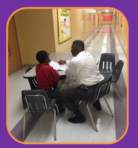
Young Lion Book Club sponsored by Coalition for Black Male Achievement, each mentor volunteer one hour per week to a youth.