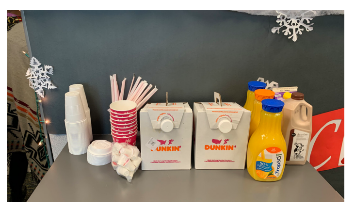
selected partner throughout the office. At the staff breakfast held on December 18, each person had the opportunity to reveal who their partner was for the gift exchange.