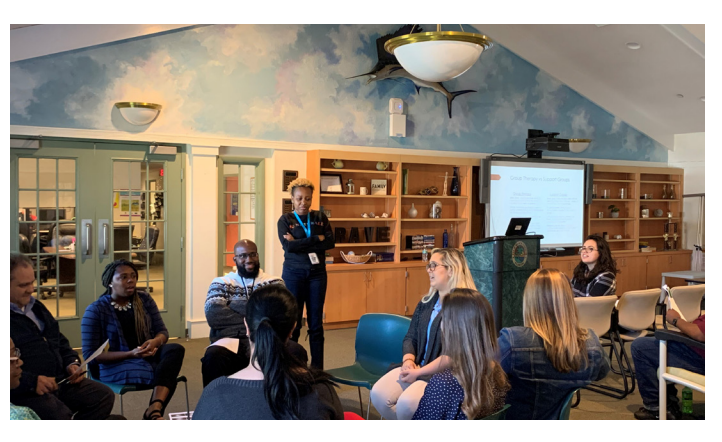
For more information about Residential Treatment and Family Counseling, visit <a href="https://www.youthservices/counseling.com">www.youthservices/counseling.com</a>.