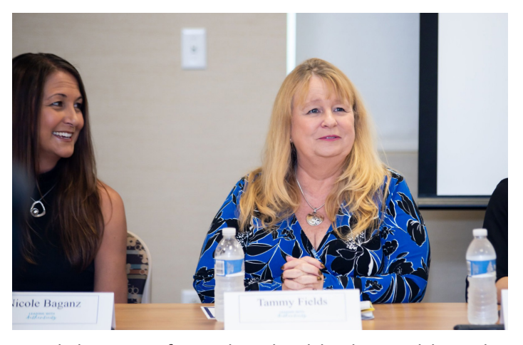
panel discussion focused on local leaders and how their personal experiences have shaped the work they do in the community.