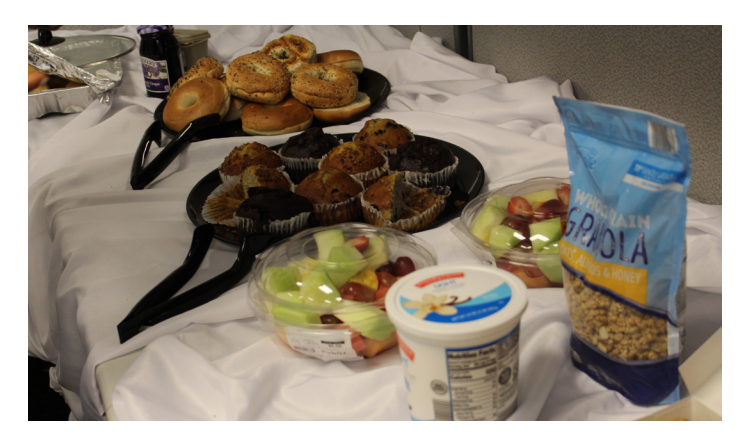
Youth Services Department celebrated the holiday season with a pot-luck breakfast! Staff members also participated in a Secret Santa gift exchange! Throughout the week the YSD team got into the holiday spirit by placing gifts for their