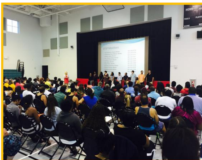
Over 100 agencies attended the training required to become a summer food site.

2015 SUMMER FOOD SERVICE PROGRAM REGISTRATION LINK: https://adobeformscentral.com/?f-2-KYjKJMO-8t8cy-YH15ZA For more information about our programs visit our Facebook page: https://www.facebook.com/pages/Palm-Beach-County-Summer-Food-Service-Program/275464805907575 To follow updates about the Summer Food Program follow us on Twitter: https://twitter.com/PBCYSD