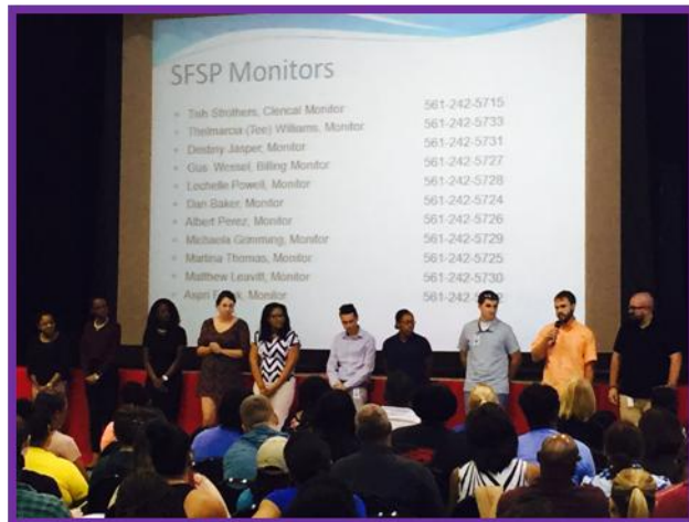
Summer food interns introducing themselves to agencies who registered to become a summer food site.

Over 100 agencies participated in the training required to become a summer food site. Summer food sites provide meals and snacks to low-income school-age children during the summer months (June-August). Children age 18 and under may receive meals through the Summer Food Service Program (SFSP). This program is funded by the United States Department of Agriculture and the Department of Education. Sites are located throughout Palm Beach County