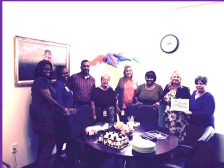
Celebrating Administrative Professional's Day!